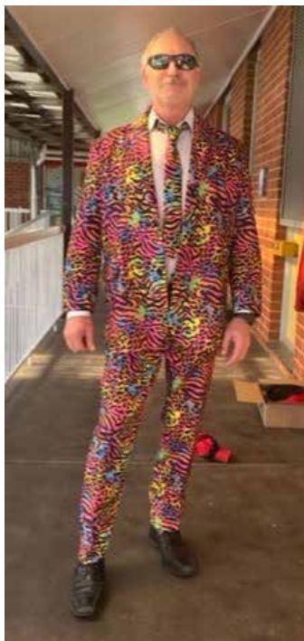
New school uniform or $8,000 challenge? Worn all day btw, much to the delight of the LPS fashionistas.

I have no words to describe how amazed I am at our LPS school community and your commitment to supporting this fundraiser. Our little school has collectively raised $9061.16 thus far and with 2 days remaining ... how high can we go? On behalf of the P&C, staff and students, THANK YOU!