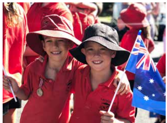
Anzac March Blast from the Past - 2019