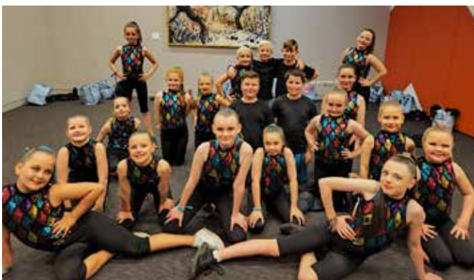
Primary group – Red