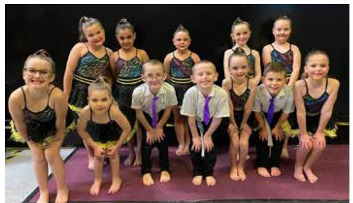
Infants dance group