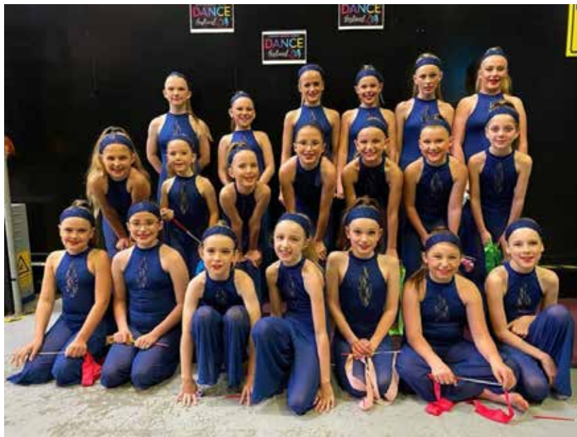
Primary group - Black