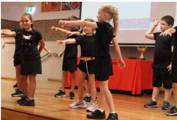
1/2S - performing 'Dinosaur Stomp'

It was lovely to start our assemblies again. Perfect behaviour from the kids, quality evidence of student achievement and the joys of the 'unscripted' scenario are what makes our assemblies so special. Congratulations to 1/2S and 6C for providing the entertainment for their peers.